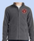
Full Zip Fleece