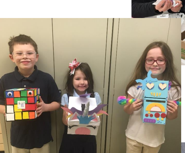
Crazy about St. James with Crazy Hair Day!