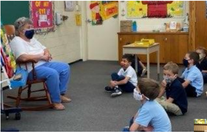
Sitting on the floor is a great place for storytelling in first grade.