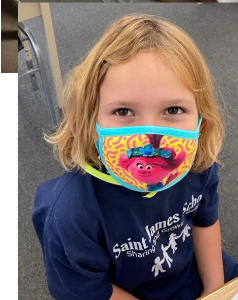
If you have to wear a mask, it might as well be fun!