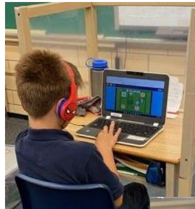
Second and third graders use their personal chromebooks to practice using Google classroom and hone their Math skills playing math games.